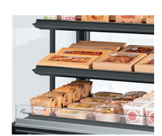
Ultimate product visibility - transparent design, thin shelves, no distraction.