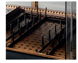
Wide range of accessories available