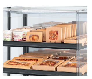
Food (literally) in the spotlights -LED lighting above each shelf.